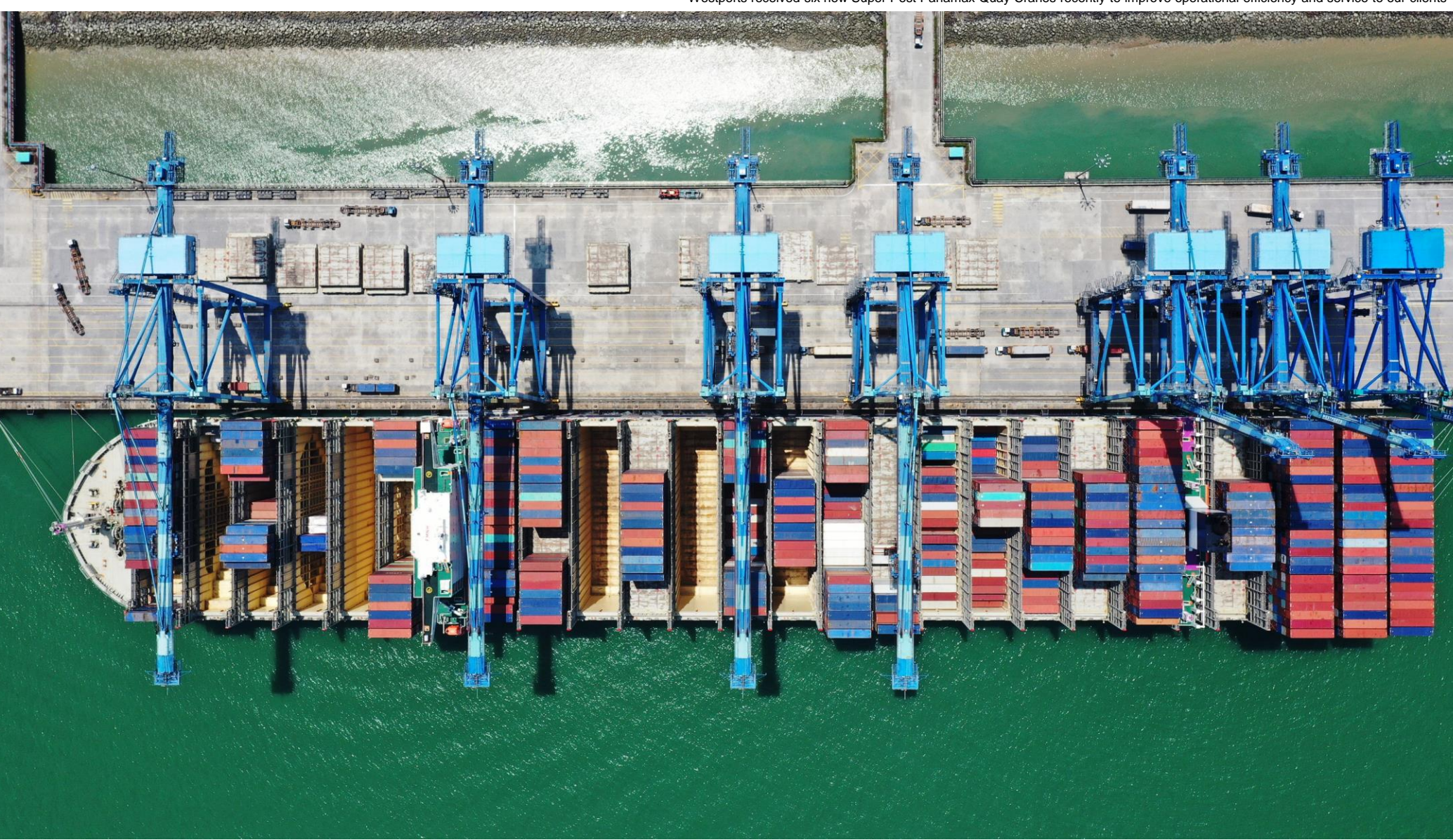
Westports received six new Super Post Panamax Quay Cranes recently to improve operational efficiency and service to our clients